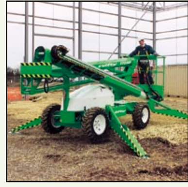
Also available on a self-drivable 2x4 or 4x4 base, the Nifty 170SD .